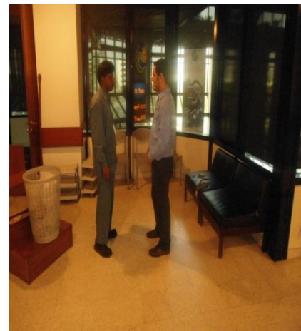
ERT member giving instructions