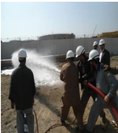
Fire Drill at Location

International Firefighters' Day is a tribute to all those who have dedicated their lives to save ours. Today we reiterate our commitment to provide best emergency, rescue and firefighting services to meet any eventuality and inculcate a sense of security and protection within the employees. Let us all take moment today to remember those brave firefighter that have sacrificed their lives in the line of duty and applaud who are devoted to protect us.